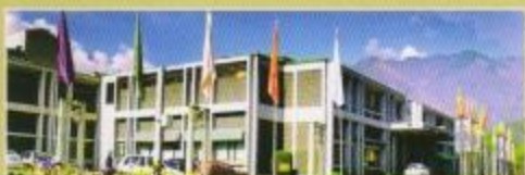
Sher-i-Kashmir International Conference Centre (SKICC)